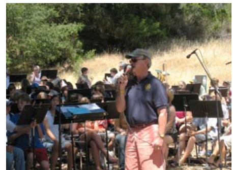
Concert at the Res, 17 May 2008