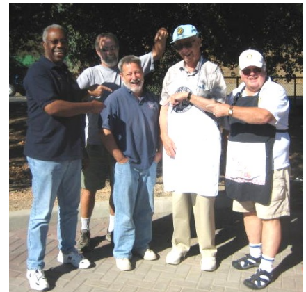
Grand Opening of the Rink

More than a theme, Rotary Shares is a call to action. Sharing Rotary ensures that Rotary continues a second century of service.